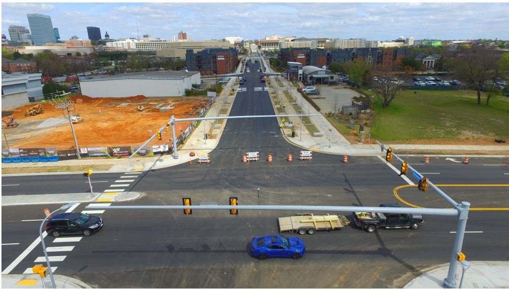
INNOVISTA - GREENE ST. PHASE 2