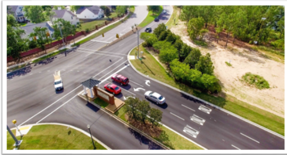
Summit Pkwy and Summit Ridge Intersection