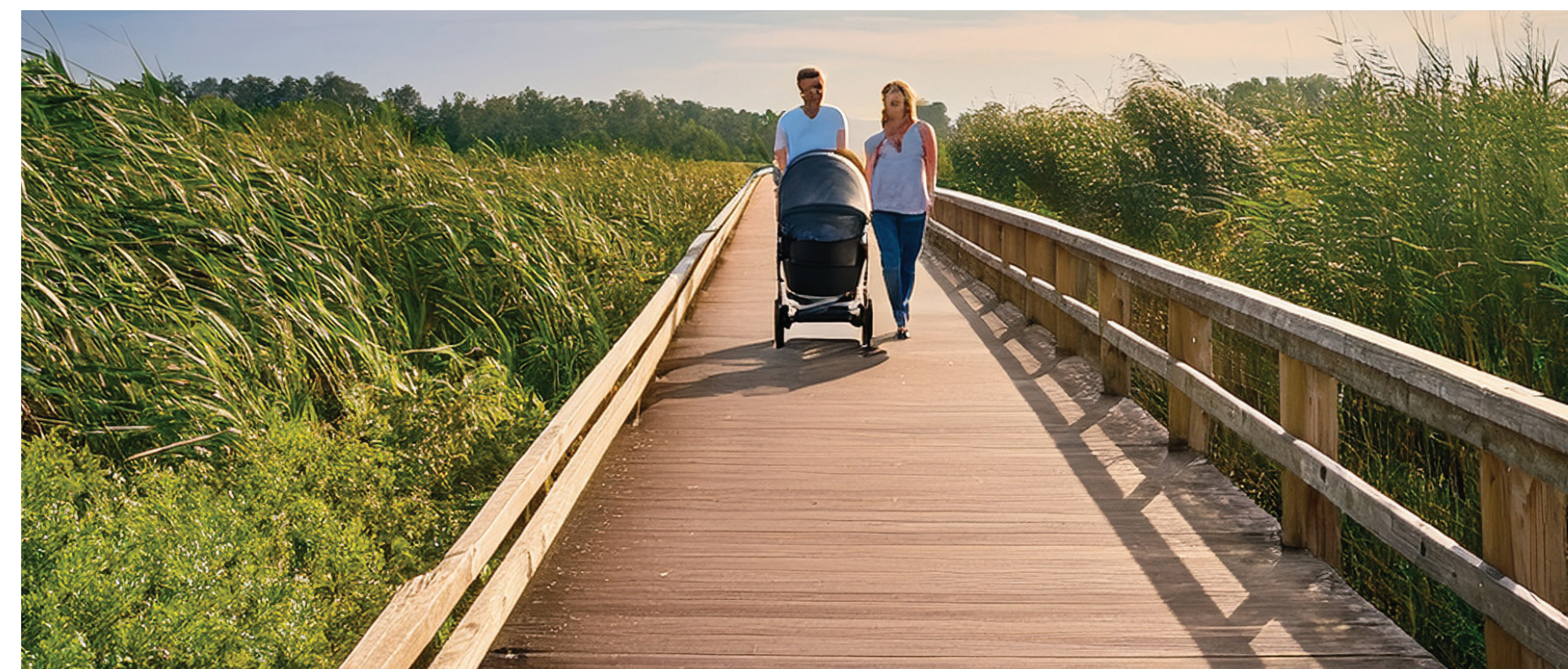
Elevated Boardwalks to protect wetlands & flood-prone areas