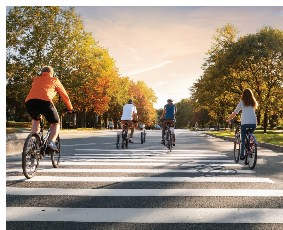
Marked Crosswalks at key intersections