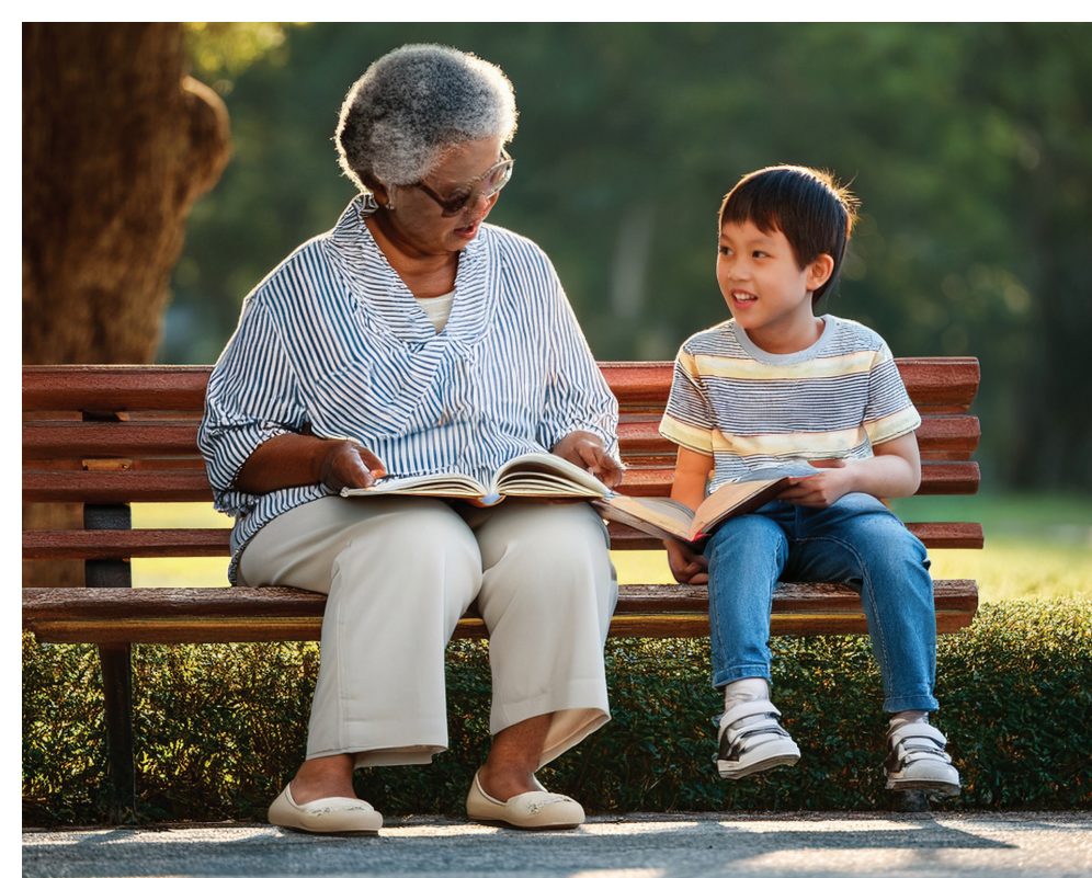
Park Benches for rest and scenic views