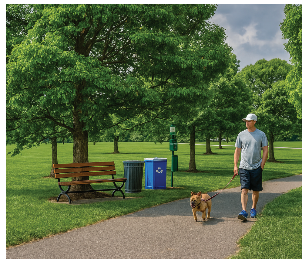
Paved Multi-use Path

Key design features of the proposed greenway include: